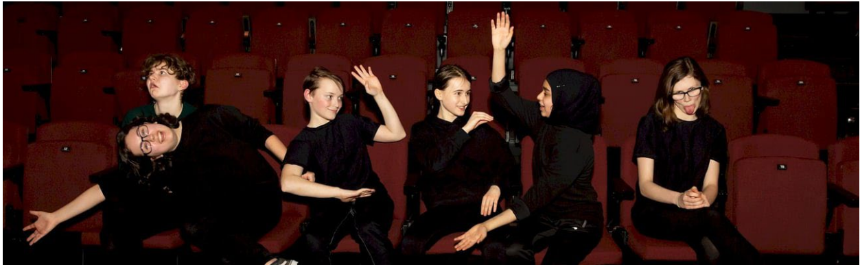
Image Description: Six youth sitting in theatre seats in different positions. Some with their hands up, one sticking their tongue out and others leaning over. all wearing black..

Once you include a gift to the Arts Club in your will, please let us know so we can include you in The Legacy Circle with other theatre enthusiasts. We love to hear from you and invite you to Arts Club events such as our Donor Appreciation party, Season Launch, and Education showcases.