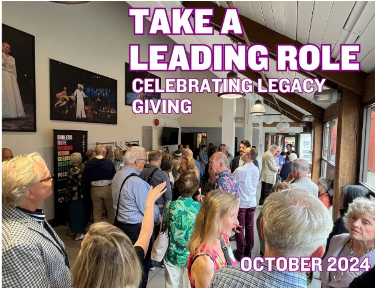
Image description: Crowd of individuals in the Granville Island Theatre lobby at a reception.