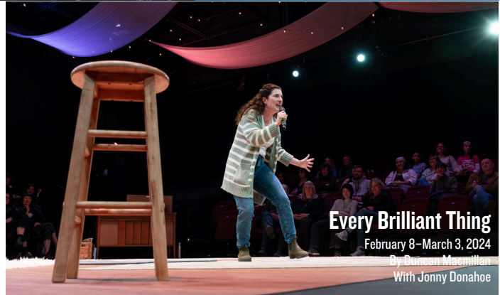
Every Brilliant Thing