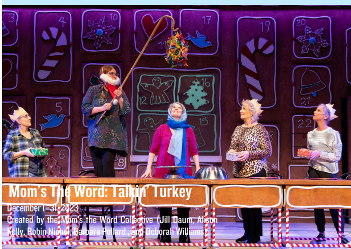
Mom's the Word: Talkin' Turkey