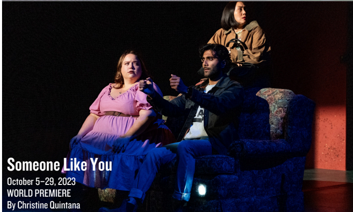
Someone Like You