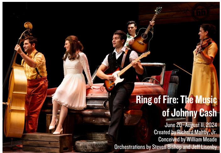
Ring of Fire: The Music of Johnny Cash