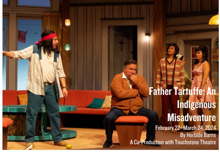
Father Tartuffe: An Indigenous Misadventure