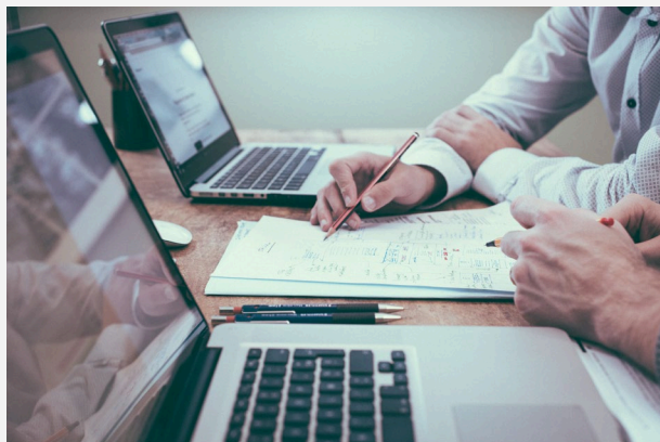
Image description: Two people are sitting next to each other with their laptops on. There is a pile of paper in between the laptops and the person on the right is pointing at the paper with a pencil.

You can designate your beneficiary outside your Will, therefore those funds are not part of your Will and they need not be probated or subjected to probate fees.